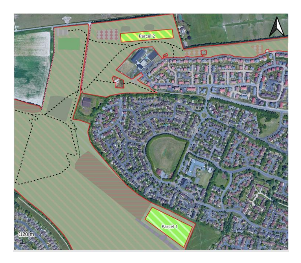
Plan showing locations of off site biodiversity at adjacent Country Park

Members should note that this current application is not subject to mandatory Bio Diversity Net Gain, and that policy CP50 only currently requires that proposals <u>demonstrate no net loss</u> of functional habitat for biodiversity in the local area. By retaining boundary features within the site and enhancing areas of the nearby country park, this requirement is fulfilled. Indeed, the <u>scheme as a</u> whole demonstrates a net gain in excess of 10%.